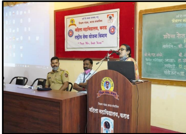
Bharosa Cell: In association with Karad City Police Station and National Service Scheme Department