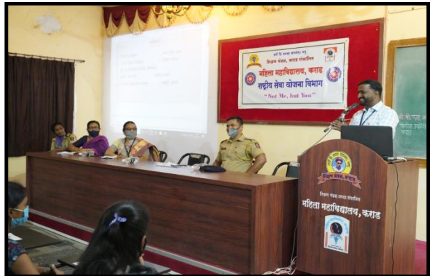
Bharosa Cell: In association with Karad City Police Station and National Service Scheme Department