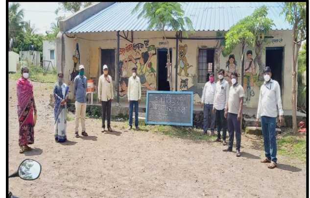
कोरोना चाचणी शिबिर