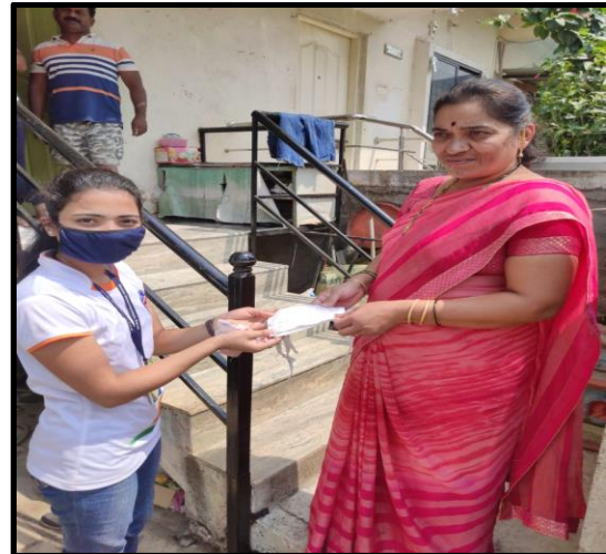
सॅनिटाइजरचे मोफत वाटप करताना स्वयंसेविका