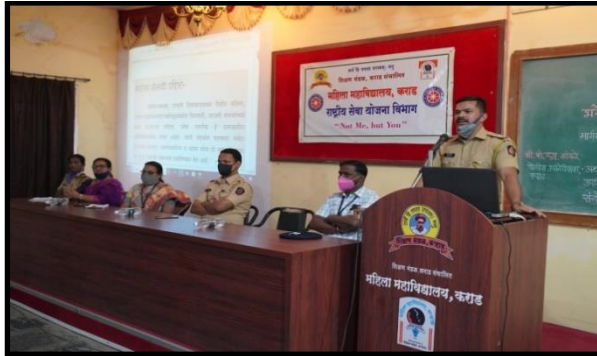
Bharosa Cell: In association with Karad City Police Station and National Service Scheme Department